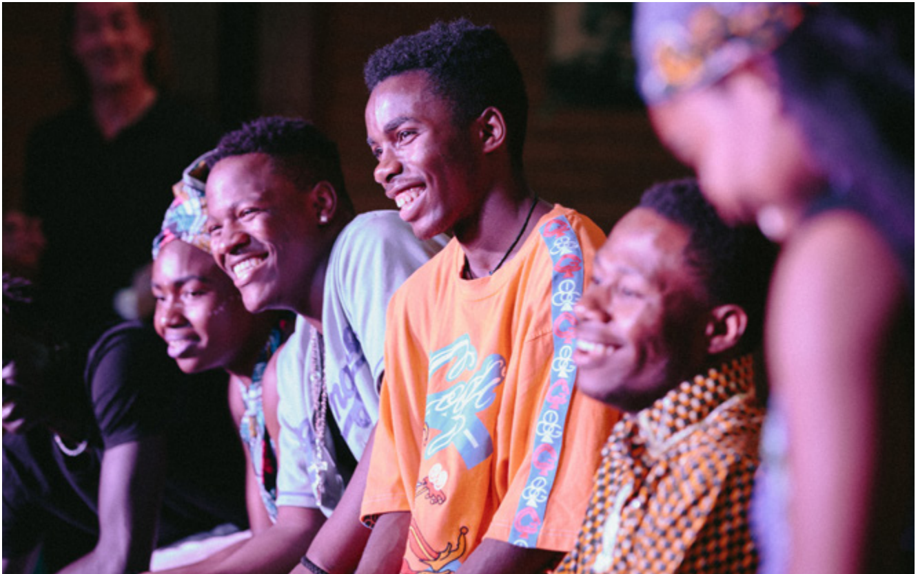
Western Edge Youth Arts Belonging Interactive Ensemble.