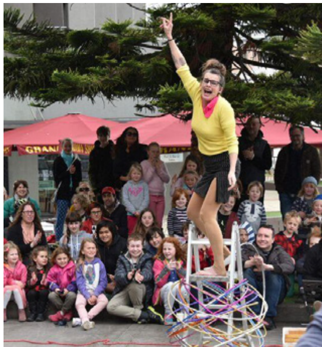
Street performance at Lorne Festival of Performing Arts.

To implement a Refugee and Asylum Seeker Youth Support 3214 program, supporting students, who are newly arrived, within a school setting.