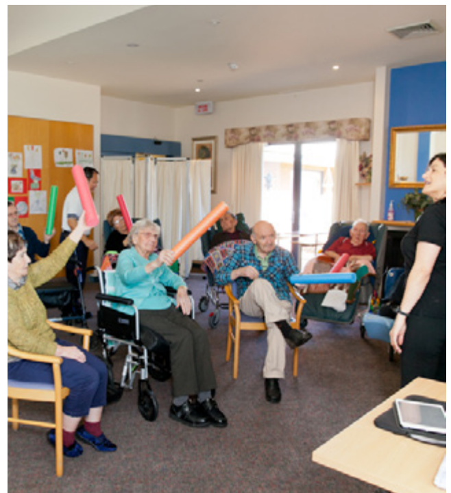
Multicultural Aged Care 'Mindful Moves' participants.

To purchase equipment to support the fit out of the meeting and training spaces at the new Geelong Community Hub.