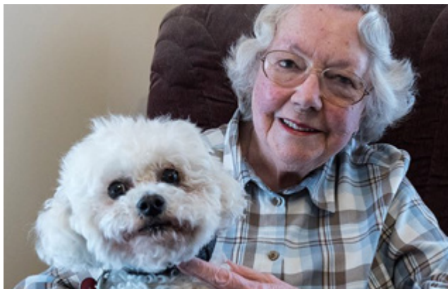
Dawn and Daisy from Cherished Pets