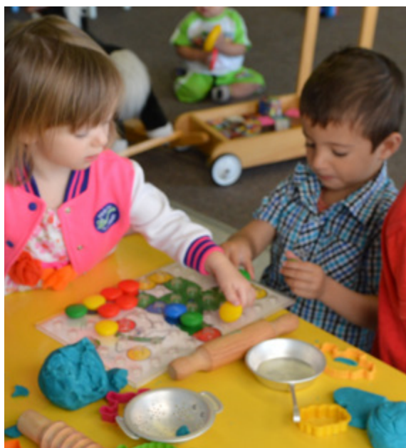
Children enjoying Bethany's supported playgroup

The men will do fundraising as a group with other volunteers, including operations such as sausage sizzles and other great concepts to assist with improving the awareness of the plight of homeless men.