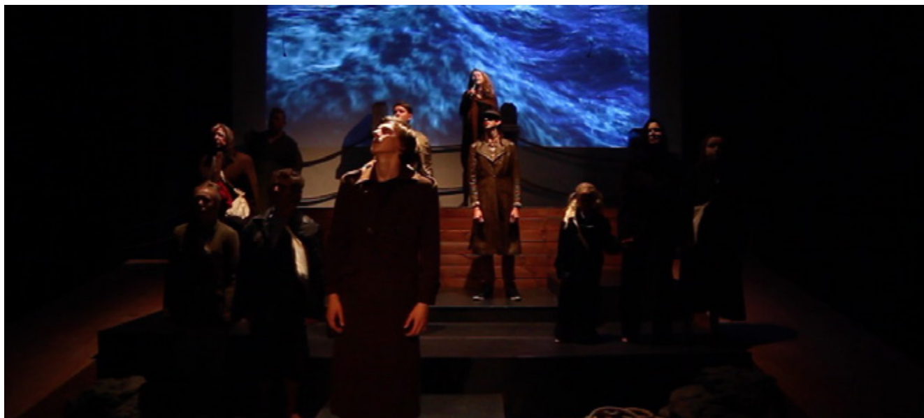
Somebody's Daughter Theatre Company 'Anchoring the Wind...Because I Matter' performance.