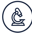
Training & Research