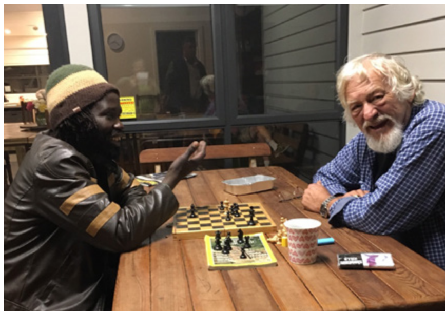
Samaritan House clients enjoying companionship and chess.