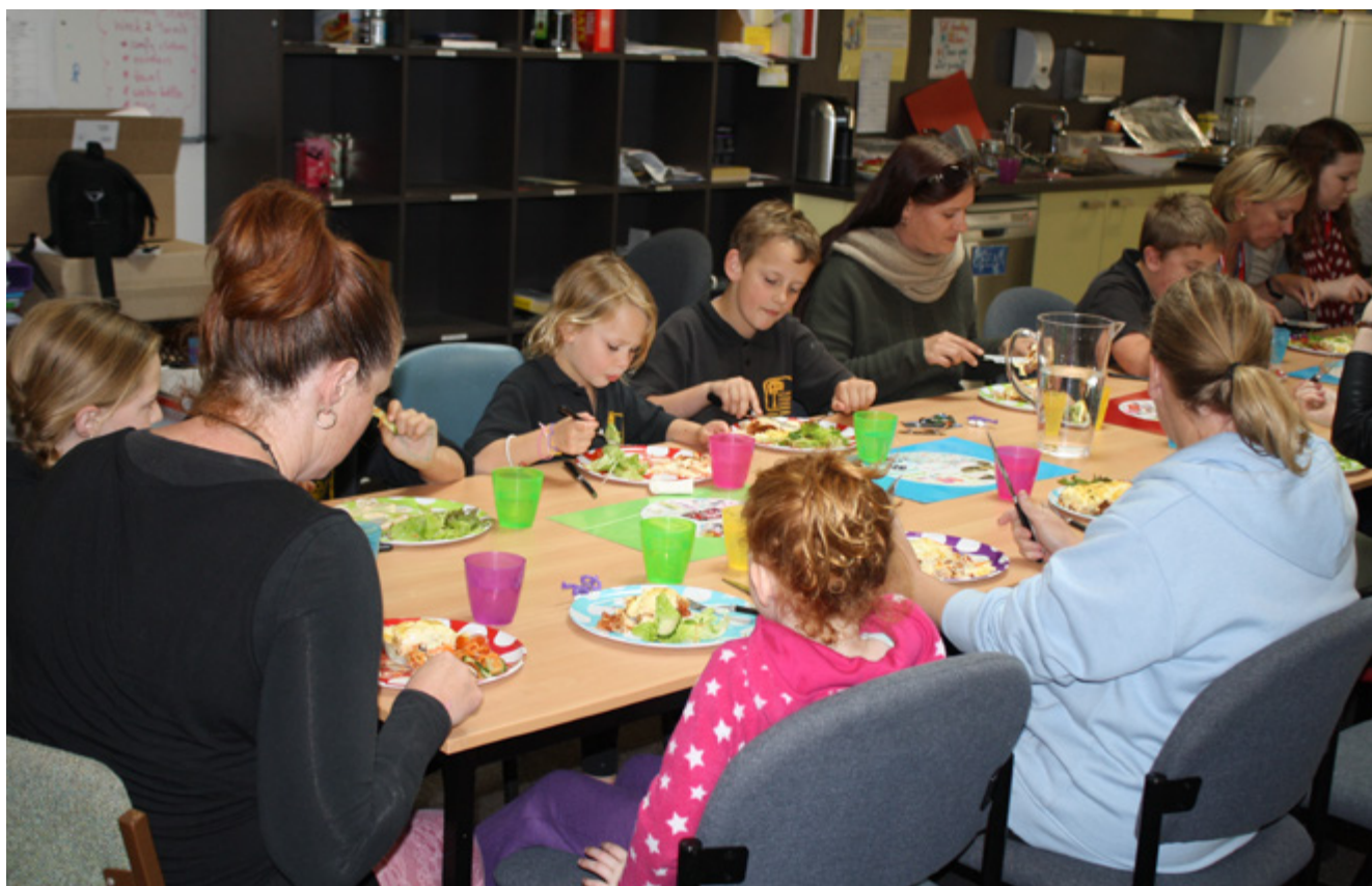
Barwon Child Youth & Family 'Strengthening Connections' between parents and children.